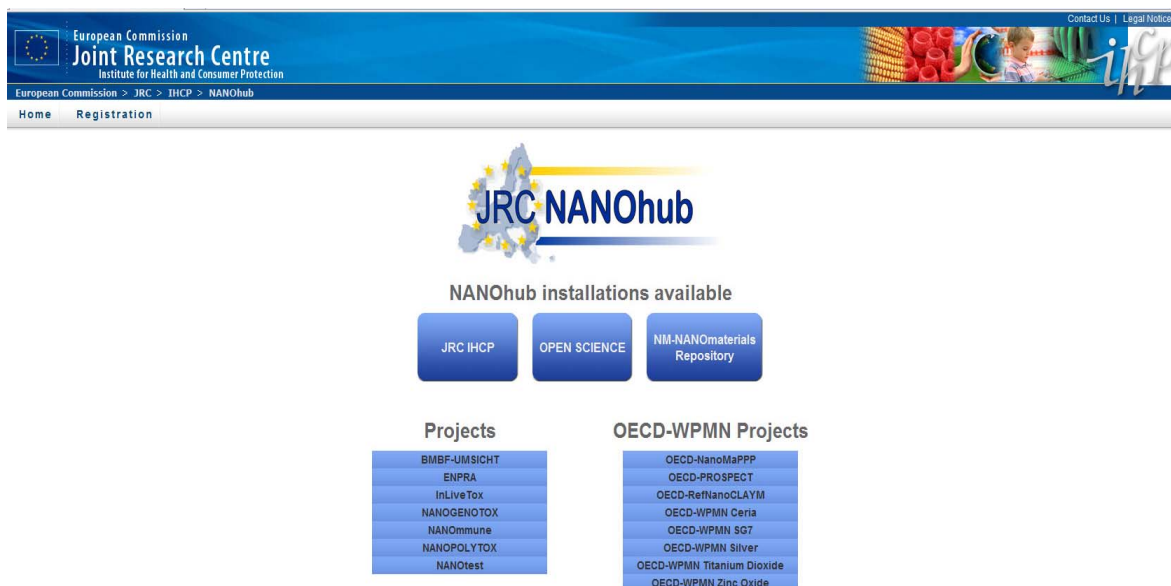
Figure 1: Structure of JRC NANOhub: projects hosted in February 2012

Users access a project-specific installation from the www.nanohub.eu website (Figure 1).