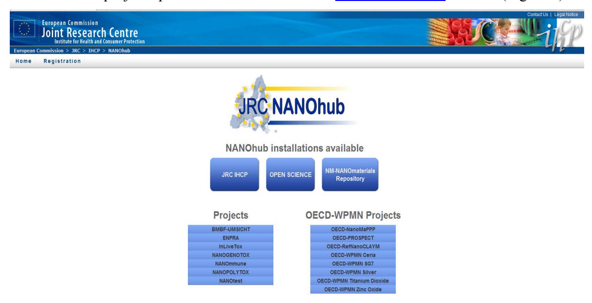
Figure 1: Structure of JRC NANOhub: projects hosted in February 2012

Users access a project-specific installation from the www.nanohub.eu website (Figure 1).